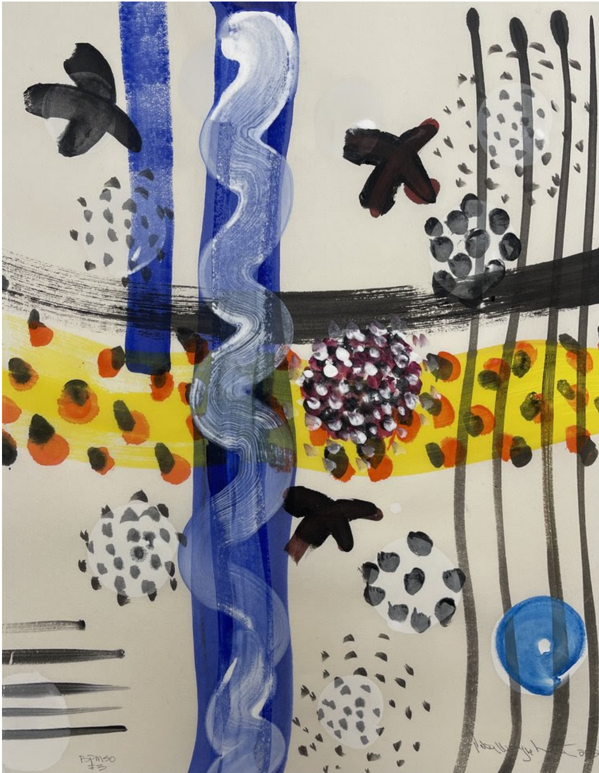
Buddha Plays Monk South Orange Suite 3, 2021