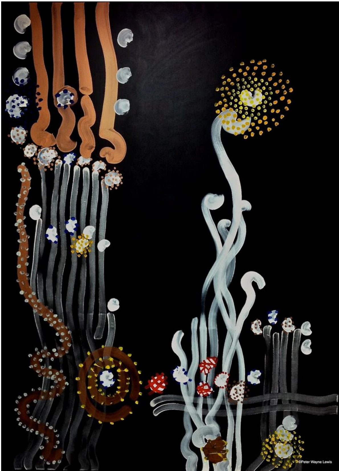
Brain Dance , 2014