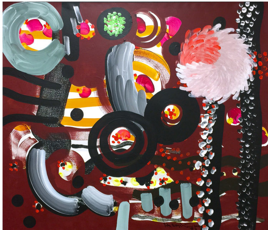
Peter Wayne Lewis, Cosmic Fiber II, 2014, acrylic on linen, 36 x 42 inches.

26 Feb–4 Apr 2015 at Skoto Gallery, New York